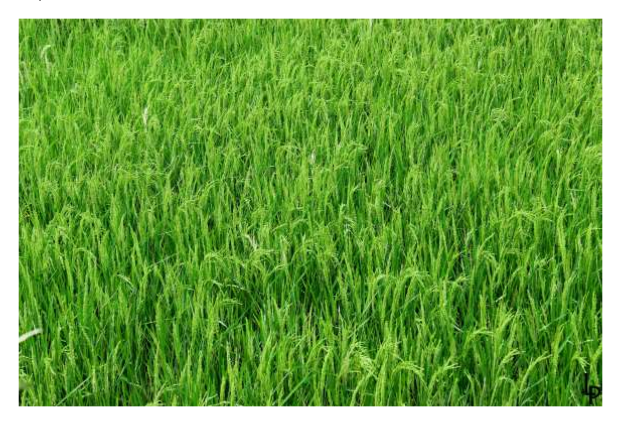
Some of the achievements in this area of work are:

farmers groups were capacitated to take up market feasibility analysis and do collective marketing. Capacity building was the main objective of WORD to create scientific awareness towards farming along with knowledge on Government resources and marketing feasibilities. Main actors in the field of food security like ICDS, MDM, Kishori Balika, PDS, Emergency feeding etc., were demanded by the community and the food security schemes were availed. Experimentation sites were created at the field level and on the field trainings were imparted to farmers. Field exposures to model sites were also done to get the feel of the impacts of the new technologies. Interface with different stakeholders like farming institutions, agriculture and horticulture departments, business units etc., were also done for learning and coordination with each other. The women were given training on skills like mushrooms, goat rearing, organic farming, value addition of NTFP produce so that they could make a reasonable income for their families.