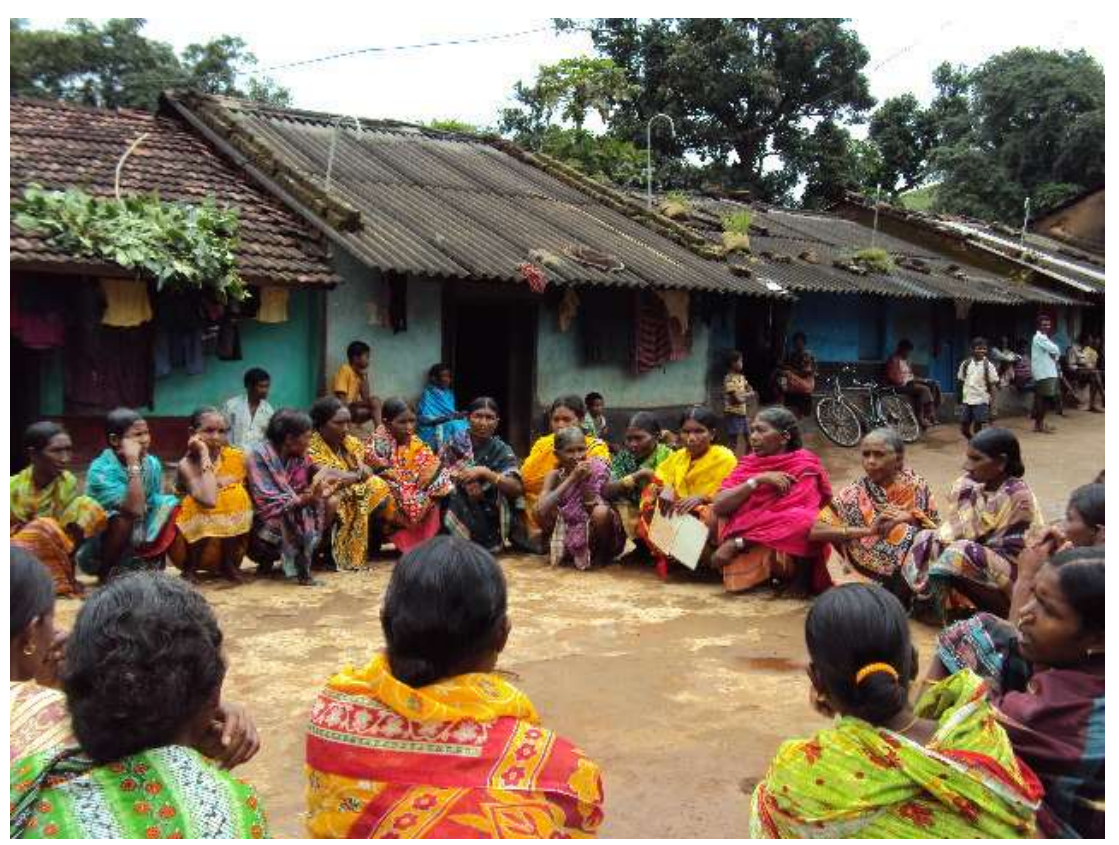
Some remarkable achievements in this area are: